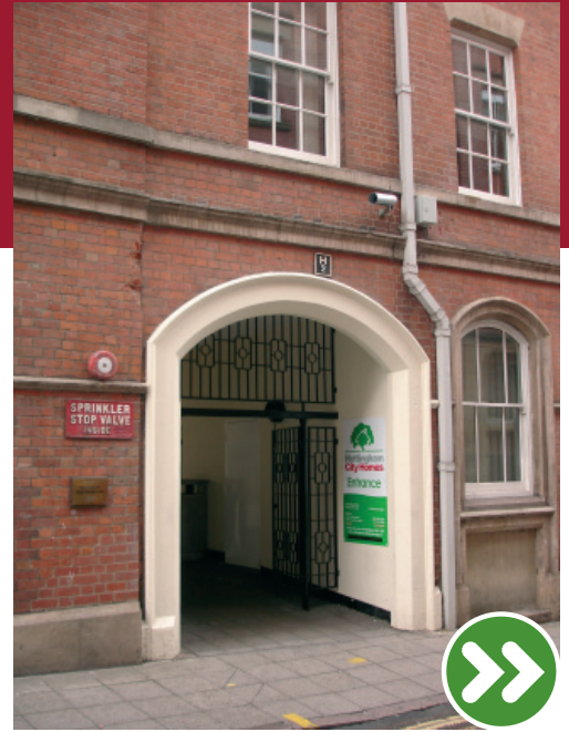
Nottingham City Homes 14 Hounds Gate Nottingham NG1 7BA